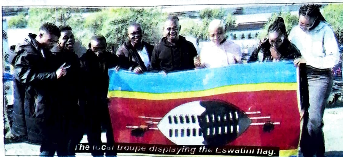
The local troupe displaying the Eswatini flag.