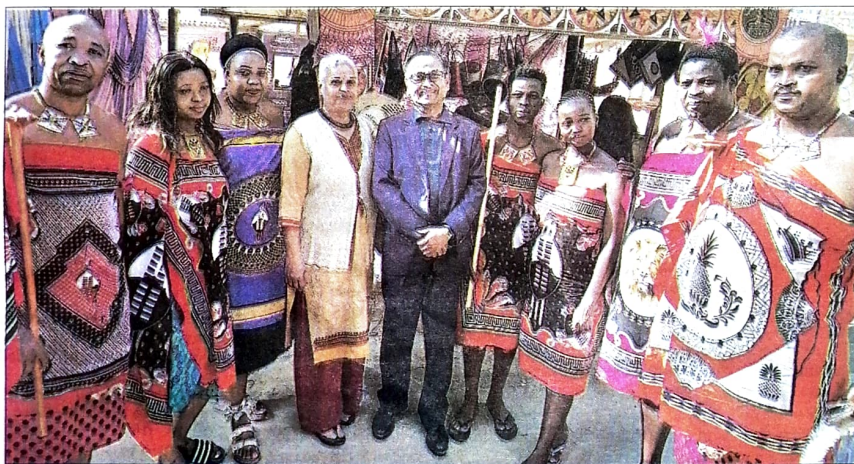
Former Indian High Commissioner to Eswatini Radha Venkataraman and a companion with the Eswatini troupe, which is currently in India. The locals also have a stall where they are showcasing local handicraft and artwork.

"I noticed that the traditional attire attracted almost all visitors at the Bazaar and they frequented the stand to take selfies and buy the wares on display.