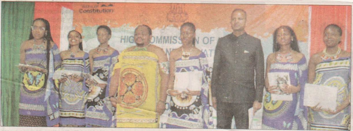
His Majesty King Mswati III's representative Prince Sicalo with the India High Commissioner with learners from Enjabulweni High School after their cultural performance.